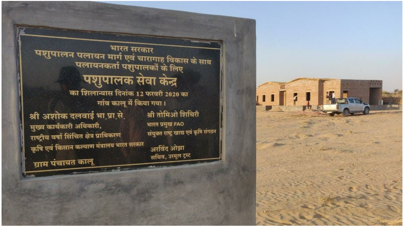
(Above) The CFC at Kalu

Post completion of the CFC at Kalu, the construction work for the second CFC at Kelan has been initiated. With the support garnered through Panchayat under MGNREGA worth 1.56 Crores, the construction work has been steered. Sustainable architecture and enhanced built environment principals have been deployed for the CFC development.