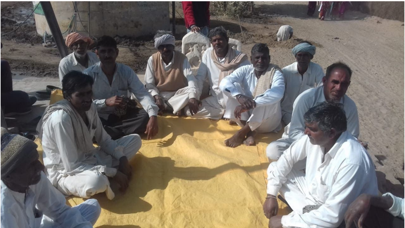
(Above 1&2) Ongoing training sessions with pastoralists

*The project materials can be accessed on this link