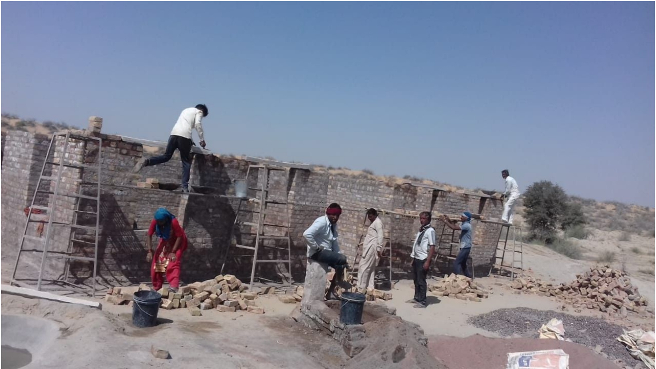
(Above) Ongoing construction of the CFC at Kelan