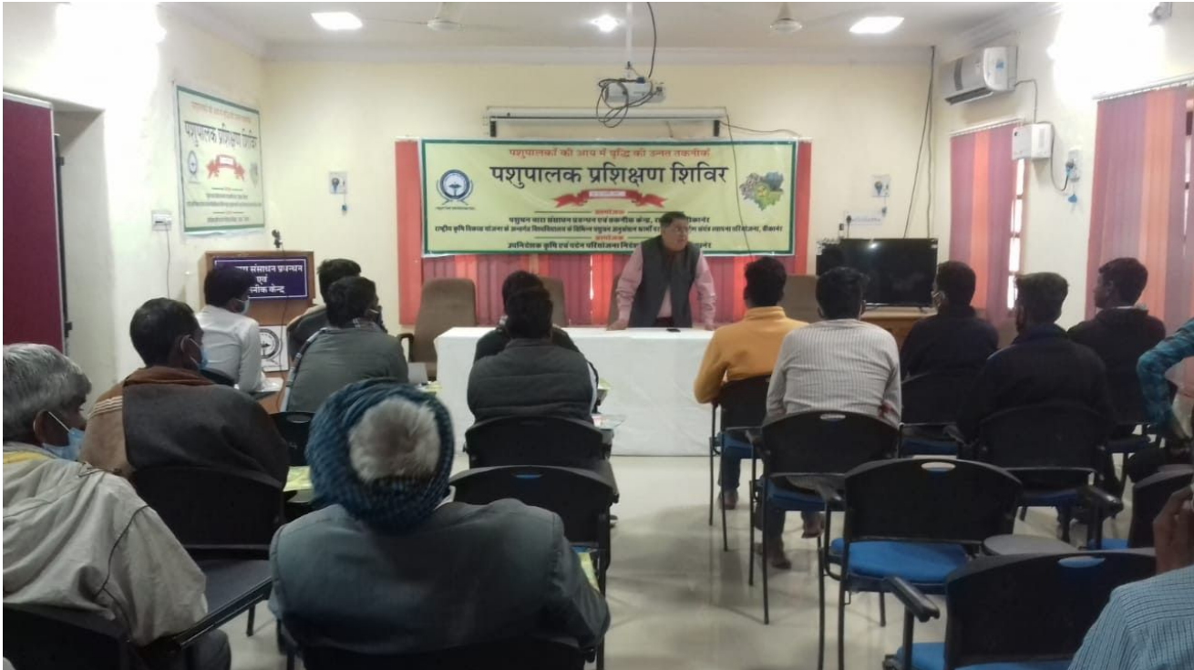
(Above) Ongoing meeting with pastoralists at RAJUVAS